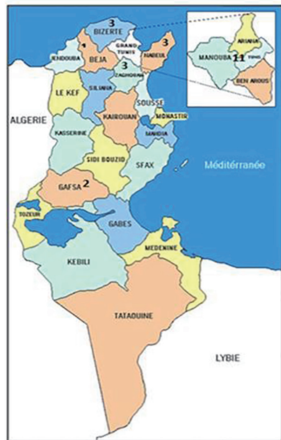
Figure 2. Repartition of GT patients according to their residence. The majority of patients (21) with GT followed in AOHHC are from the North of Tunisia. Only two of the patients are from the South of Tunisia.

dental extraction bleeding in only four patients (14%). Concerning bleeding in women, we can conclude that menorrhagia has a low frequency (35%), since it occurs only in five women in our cohort, compared to the described frequency in GT [18]. One woman achieved her pregnancy with natural delivery under platelets, while it is rare in a thrombasthenic patient since it often results in important hemorrhage requiring sometimes blood transfusions and threatening the vital prognosis of the mother [19]. For the diagnosis of GT, we use in our laboratory more than one specific test such as LTA which is extremely specific for GT, since platelet fails to aggregate with any agonist [20]. We use also flow cytometry in order to identify a platelet receptor dysfunction and/or deficiency using specific monoclonal antibodies. In the case of GT, CD41 and CD61 levels are much reduced or absent against normal levels of CD42 [21]. In our protocol patient care and since the